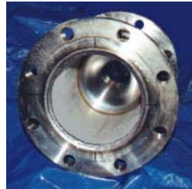
MacroFLOW w/o flow conditioner

NOTE: MacroFLOW meters are custom applied for each application. Sizing follows the well established ASME flow nozzle guidelines. Specific performance for individual models is available using the ASME predictions or using actual calibration data. For dimensional, material, performance, or instrument data contact your local InFLOW, INC. representative or the factory.